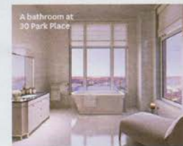
A bathroom at 30 Park Place