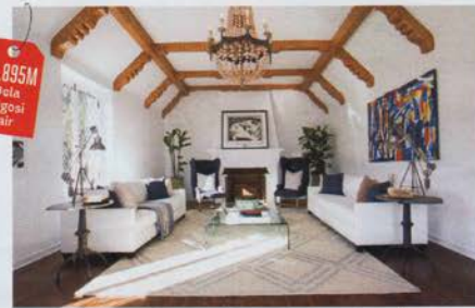
Horror legend Lugosi's restored 1926 home in Beachwood Canyon has five bedrooms and a grand living room.